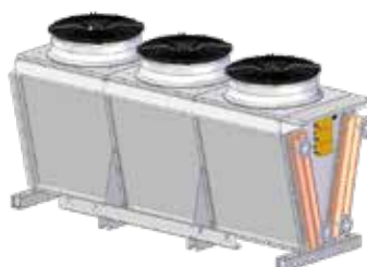
In line configuration