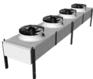
In line configuration